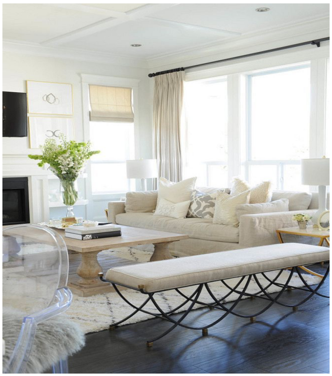
Why choose Workhouse Interiors?

Commencing in 2010 Workhouse Interiors has continued to grow and is now one of the best known brands in window coverings. Always first to market with new trends and industry technology, we have a fantastic product offering and a reputation for outstanding quality and customer service.